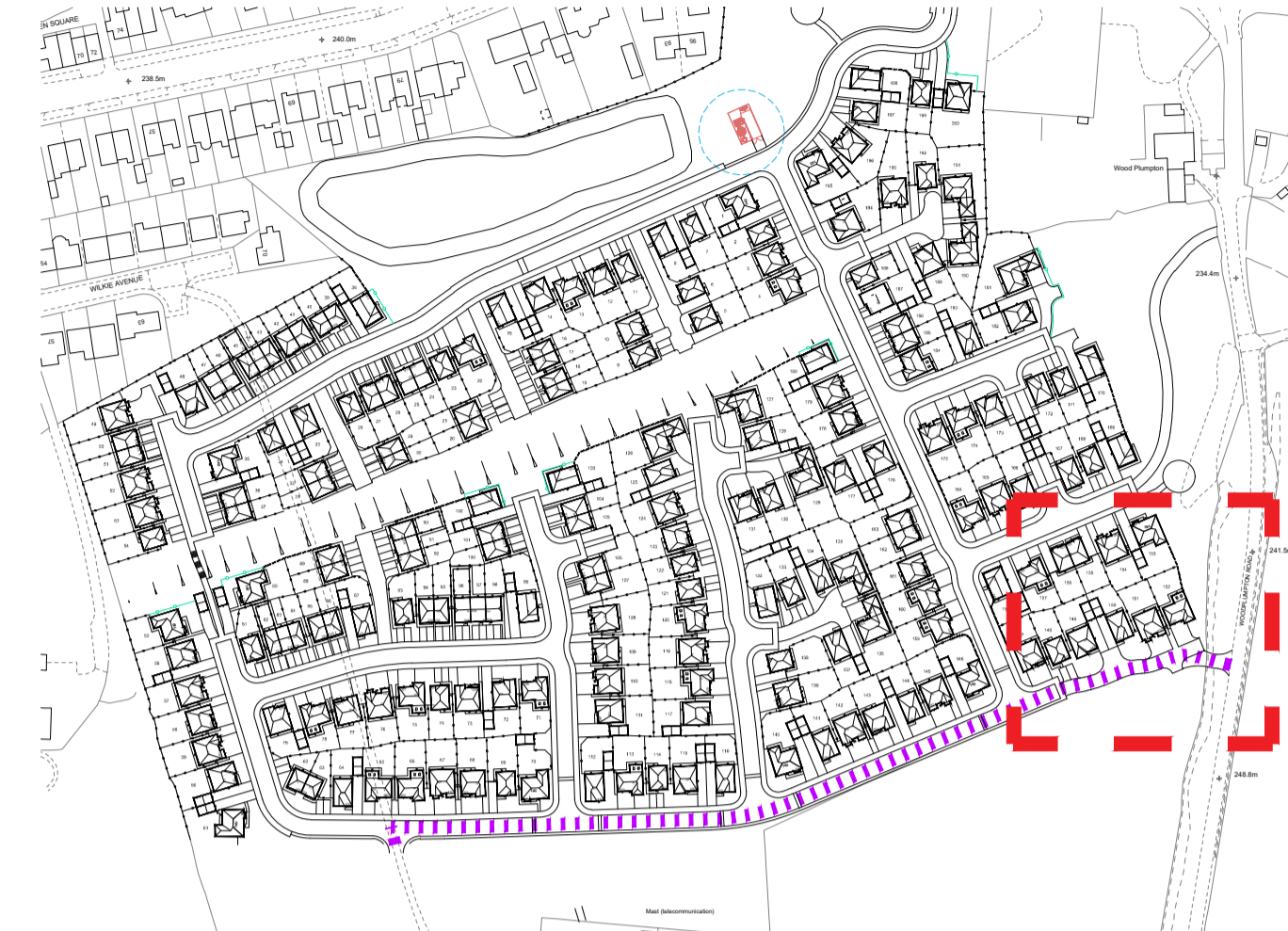
Site Key @1:2500